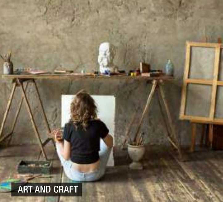
ART AND CRAFT