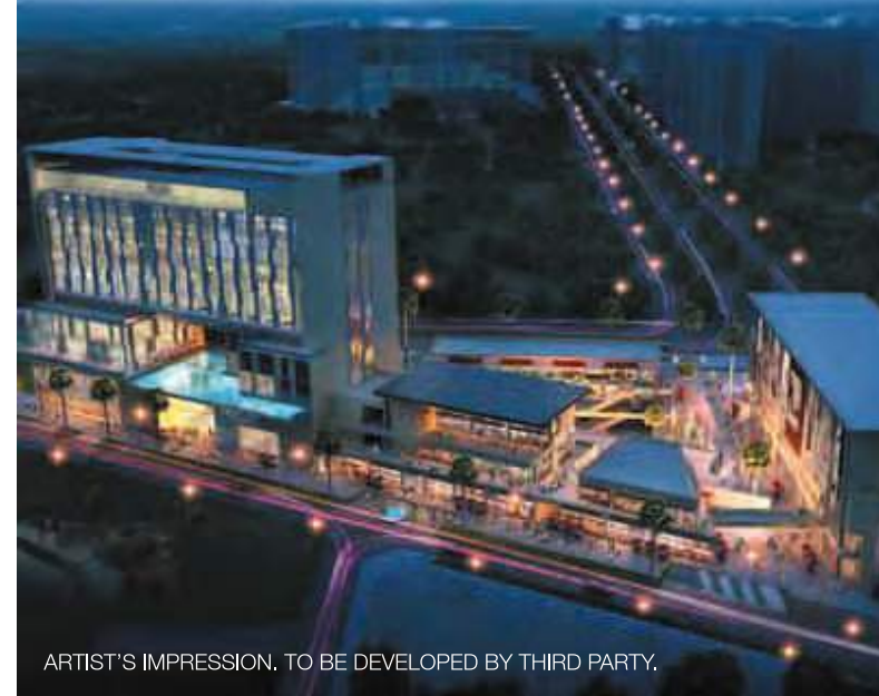
ARTIST'S IMPRESSION. TO BE DEVELOPED BY THIRD PARTY.