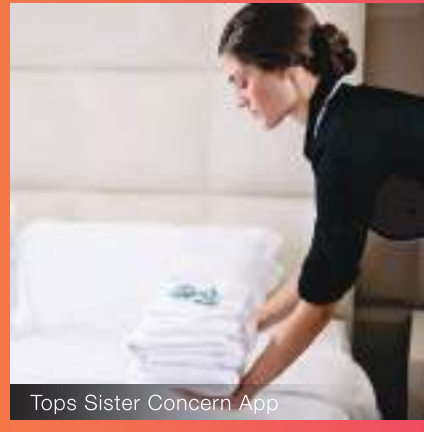
Tops Sister Concern App