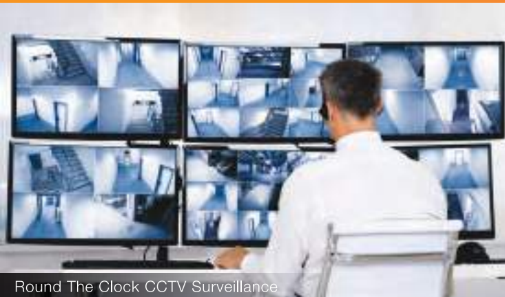
Round The Clock CCTV Surveillance