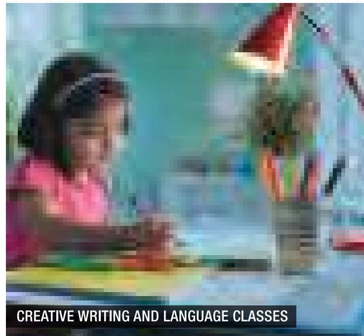
CREATIVE WRITING AND LANGUAGE CLASSES