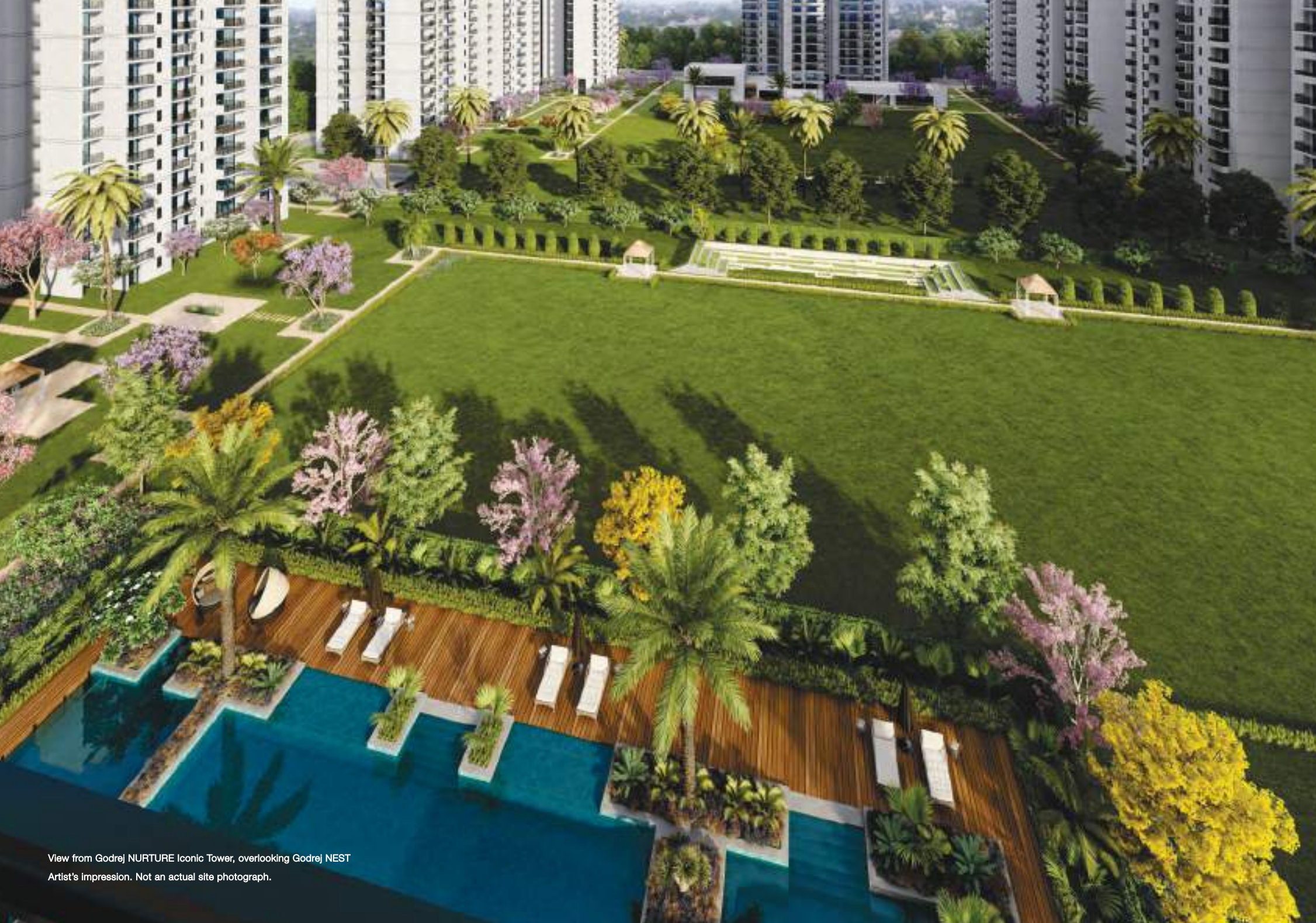
View from Godrej NURTURE Iconic Tower, overlooking Godrej NEST Artist's impression. Not an actual site photograph.