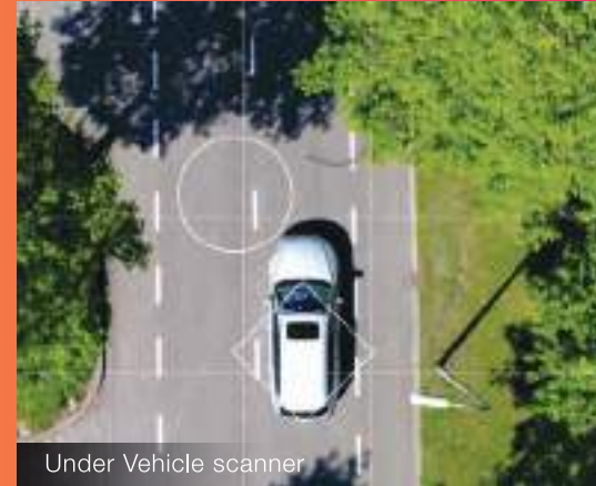
Under Vehicle scanner