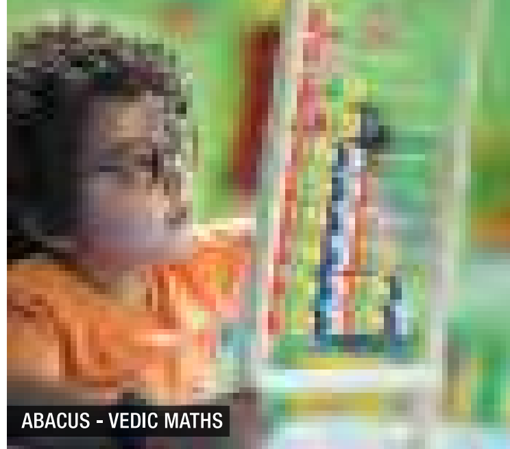
ABACUS - VEDIC MATHS