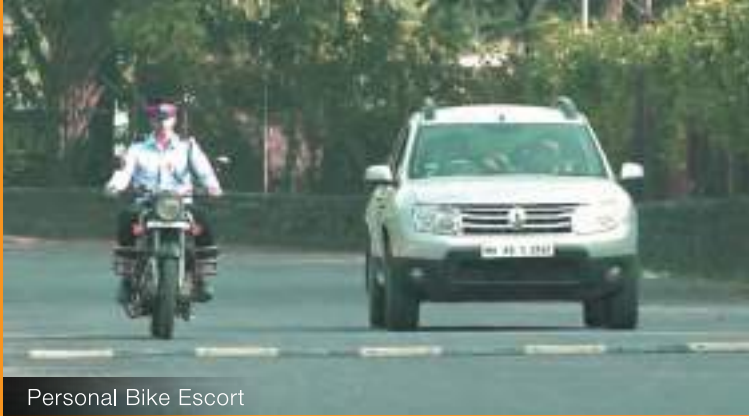
Personal Bike Escort