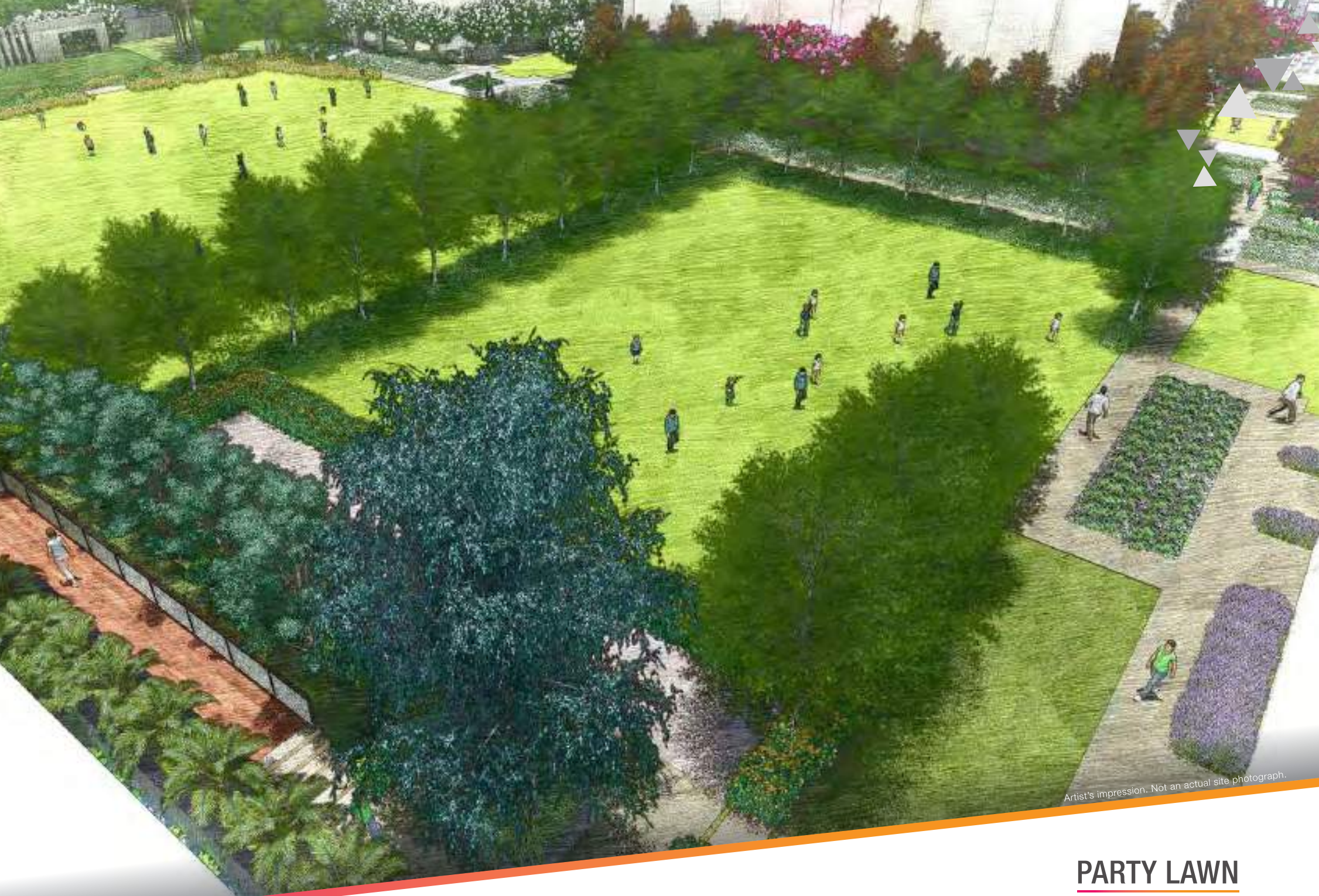
Artist's impression. Not an actual site photograph.