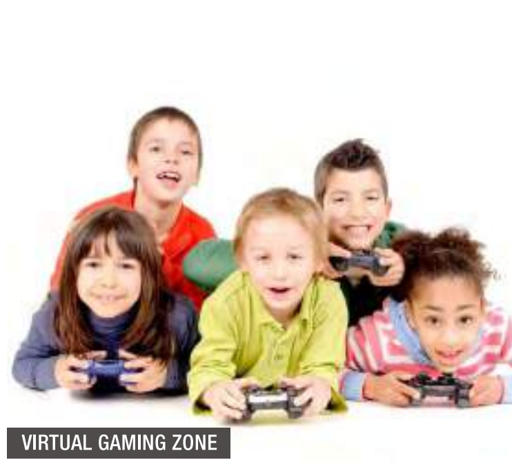
VIRTUAL GAMING ZONE