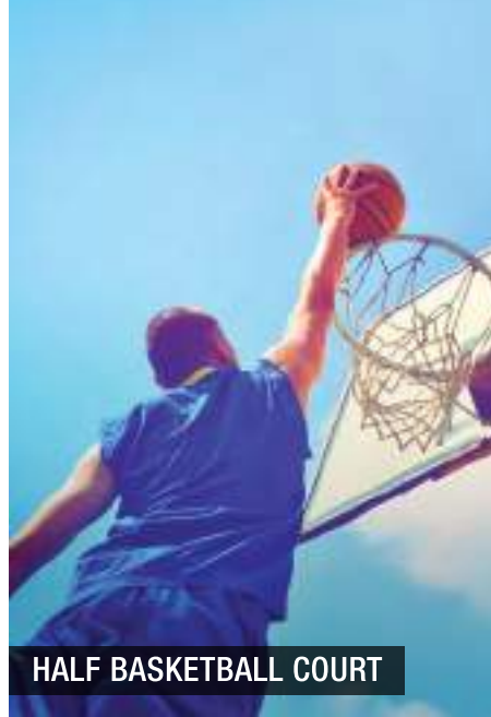
HALF BASKETBALL COURT