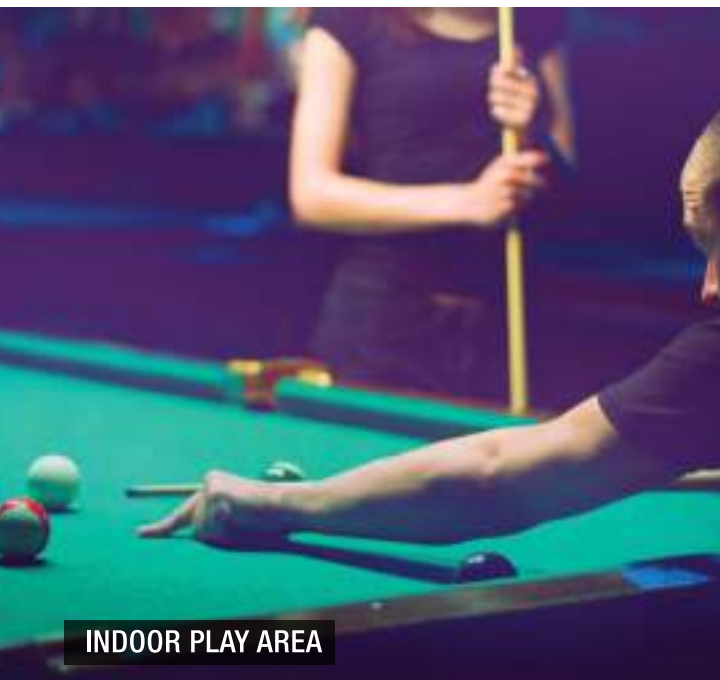
INDOOR PLAY AREA