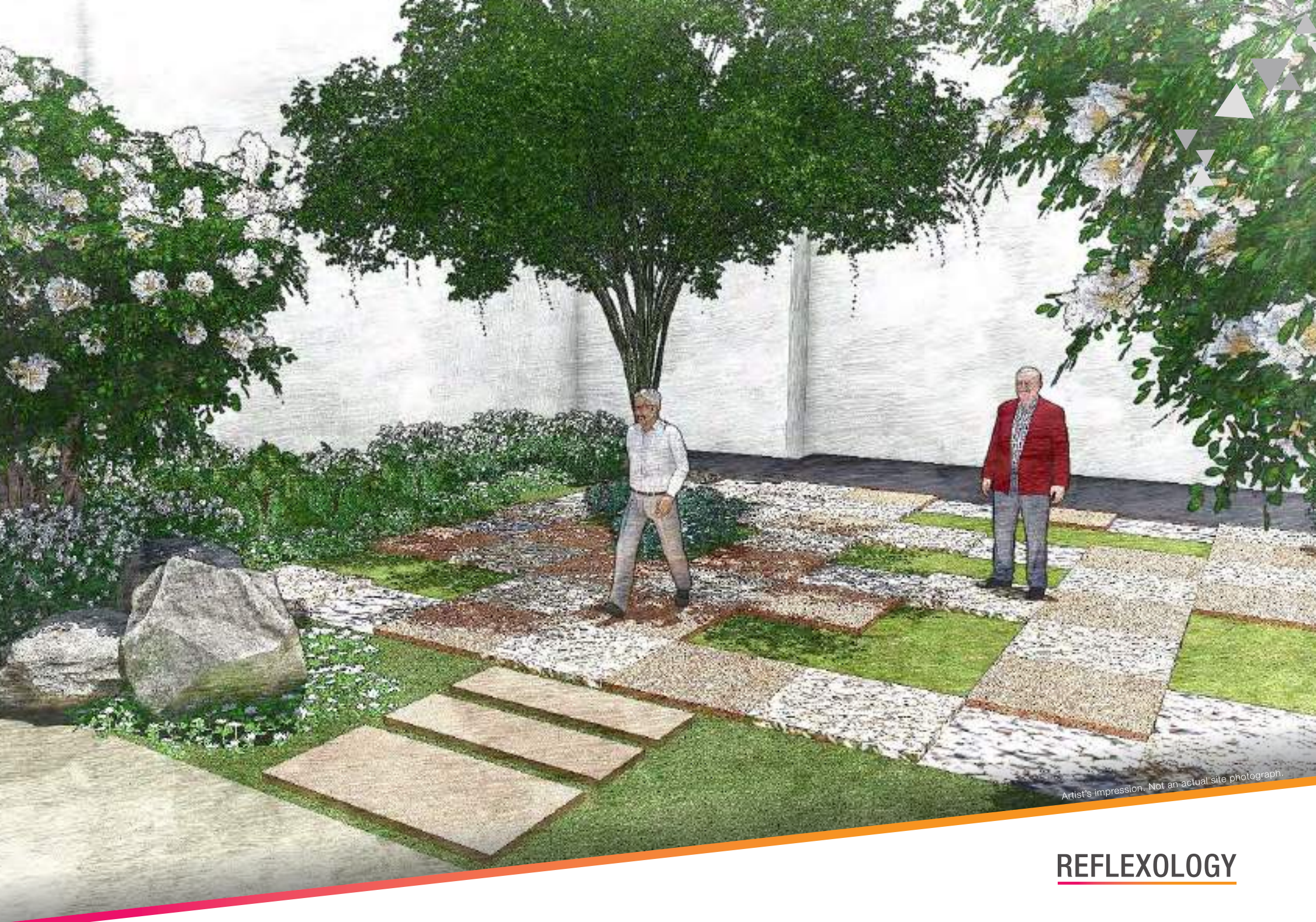
Artist's impression. Not an actual site photograph.