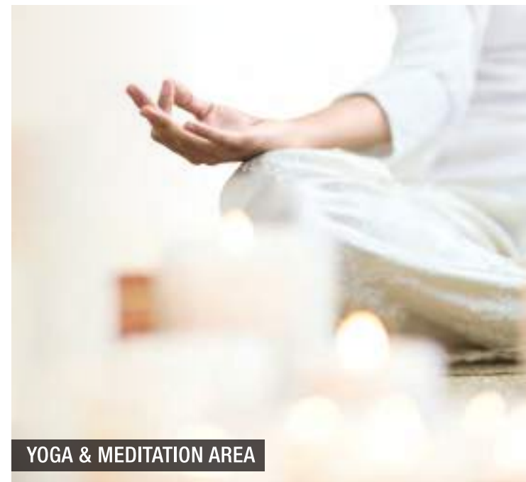
YOGA & MEDITATION AREA