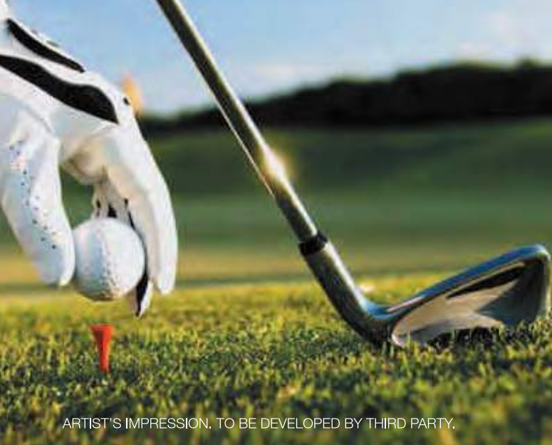
ARTIST'S IMPRESSION. TO BE DEVELOPED BY THIRD PARTY.